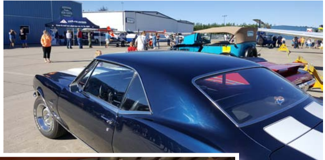
Look at those old cars on display at the fly-in