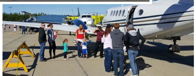
Families attending the fly-in were able to tour the Bismarck Air Medical King Airs.