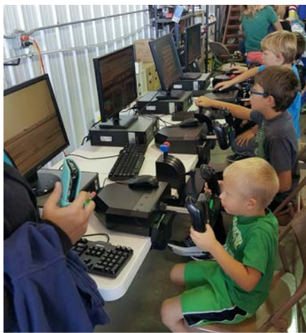
Kids practicing their piloting techniques on the flight simulators