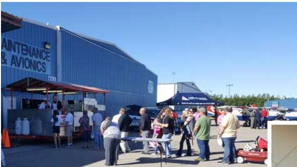
Attendees in line at the fly-in pancake breakfast