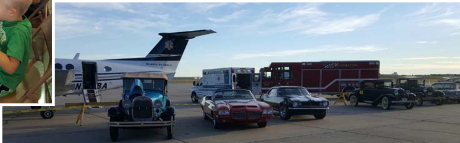
Bismarck Air Medical King Air, Metro Area ambulance, and Bismarck Fire truck sit on display at the fly-in behind some of the Dusters' Classical Car Collection.