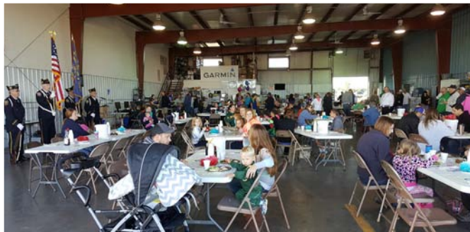
A full house as the VFW Post 1326 Honor Guard presenting our nations colors.