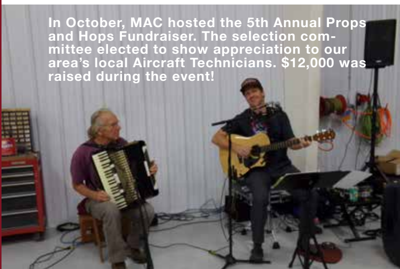
In October, MAC hosted the 5th Annual Props and Hops Fundraiser. The selection committee elected to show appreciation to our area's local Aircraft Technicians. $12,000 was raised during the event!