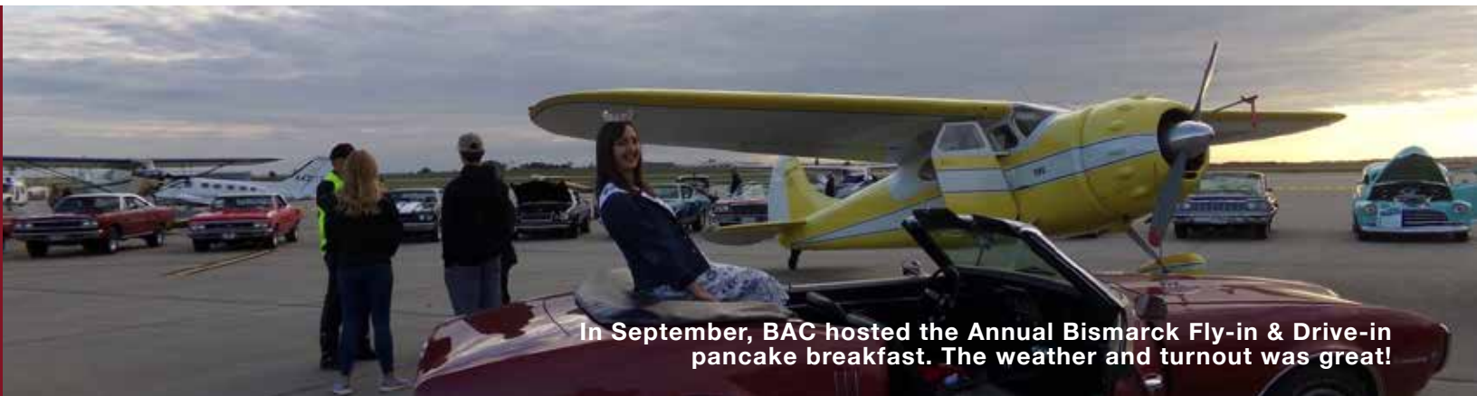
In September, BAC hosted the Annual Bismarck Fly-in & Drive-in pancake breakfast. The weather and turnout was great!